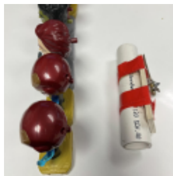
PVC pipe on side B of the barrier.