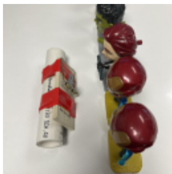
PVC pipe on side A of the barrier.